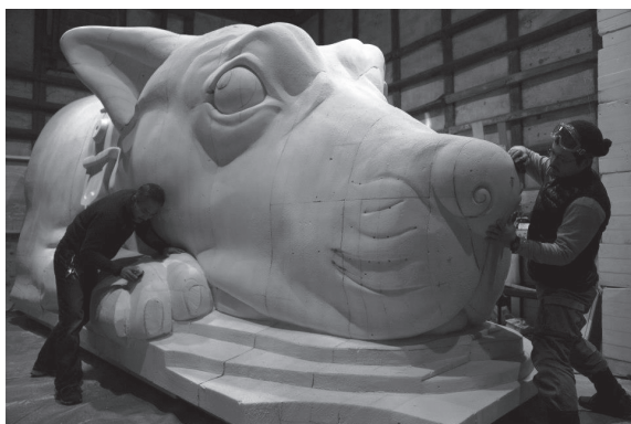
• molding process (2012/12/31)